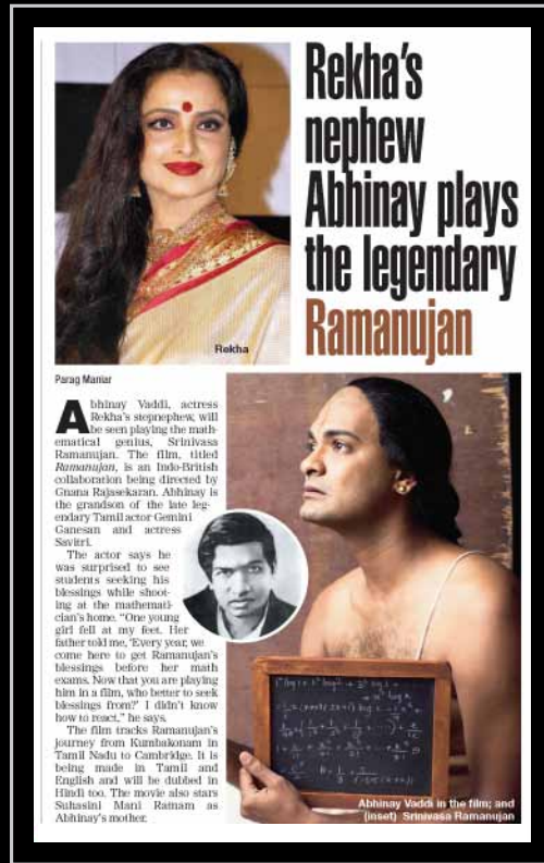
Bombay Times (Also in Ahmedabad, Goa, Pune, Bangalore, Kochi) 18th August 2013