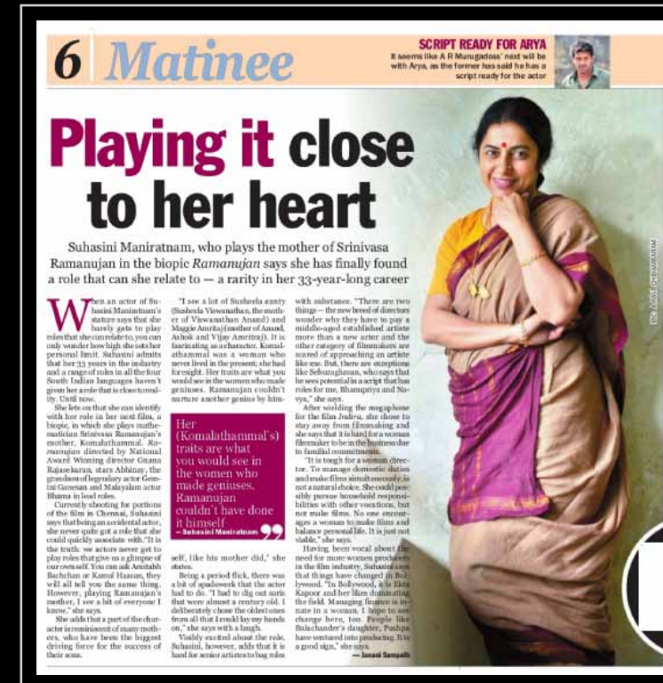
The New Indian Express (City Express) Chennai, 17th Sept 2013,