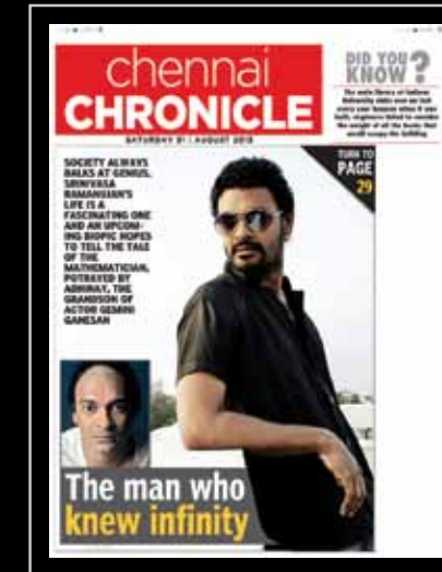
Deccan Chronicle (Chennai Chronicle) 31st August 2013