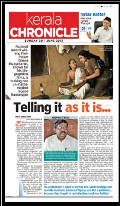
Deccan Chronical Kochi Kerela Chronicle 30th June 2013