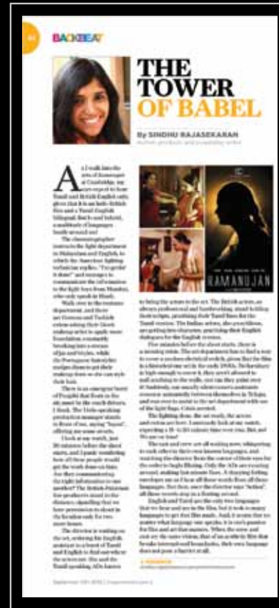
Impact Magazine Vol 10. Issue 12 1st to 8th September 2013