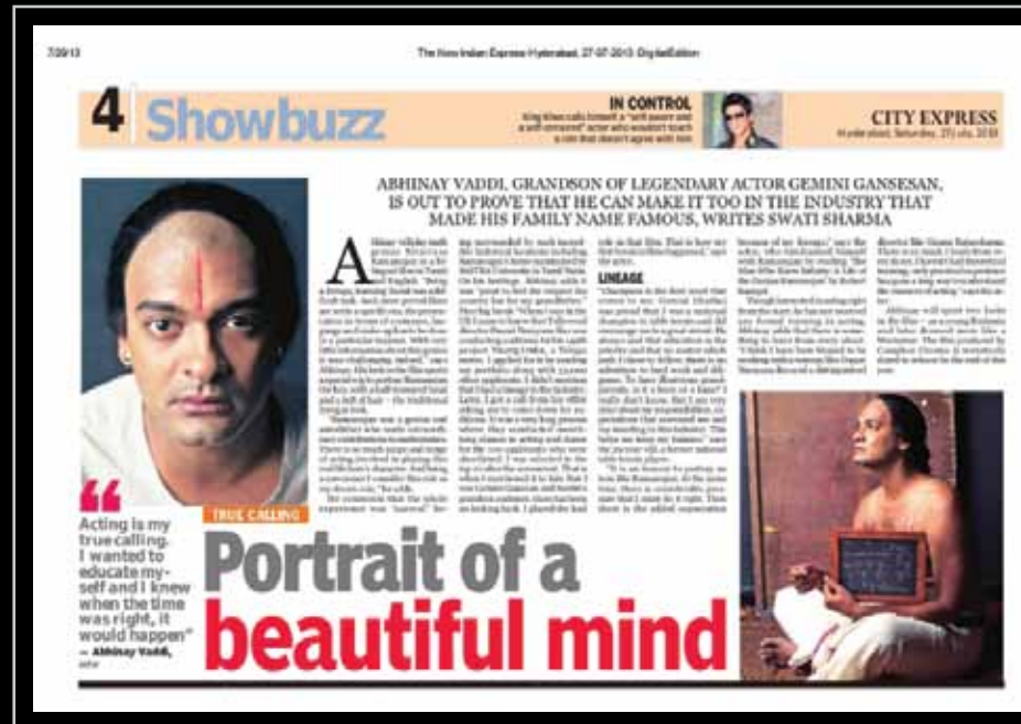
The New Indian Express (City Express) Hyderabad 27th July 2013