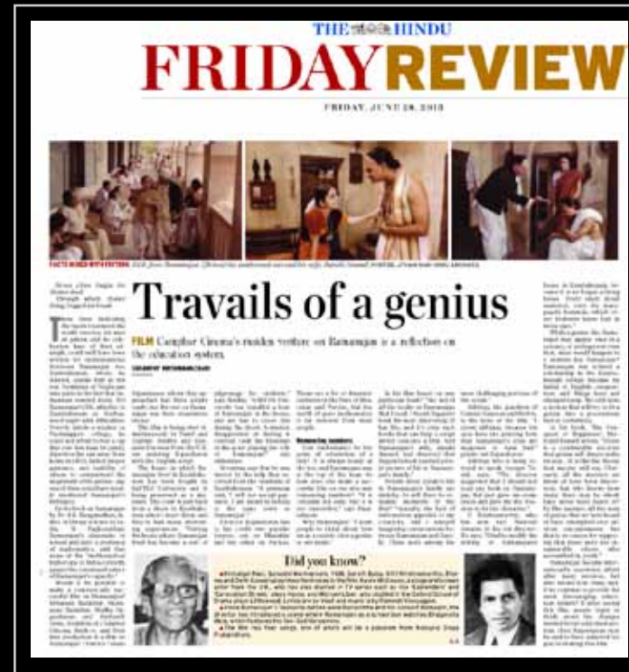
The Hindu- Friday Review (Also in Chennai, Bangalore, Hyderabad, Visakhapatnam) 28th June 2013