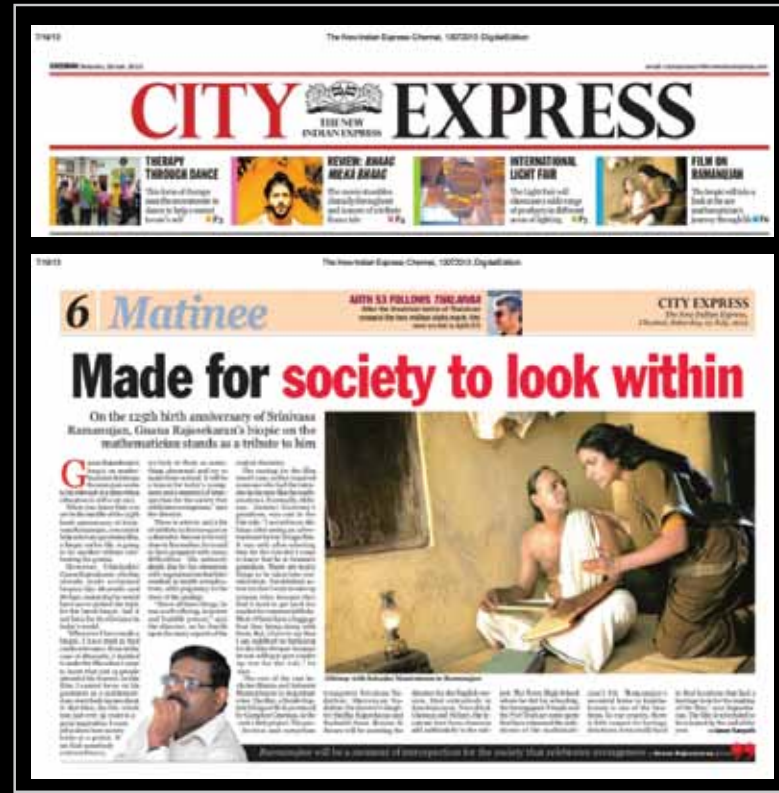
The New Indian Express - Chennai 13th July 2013