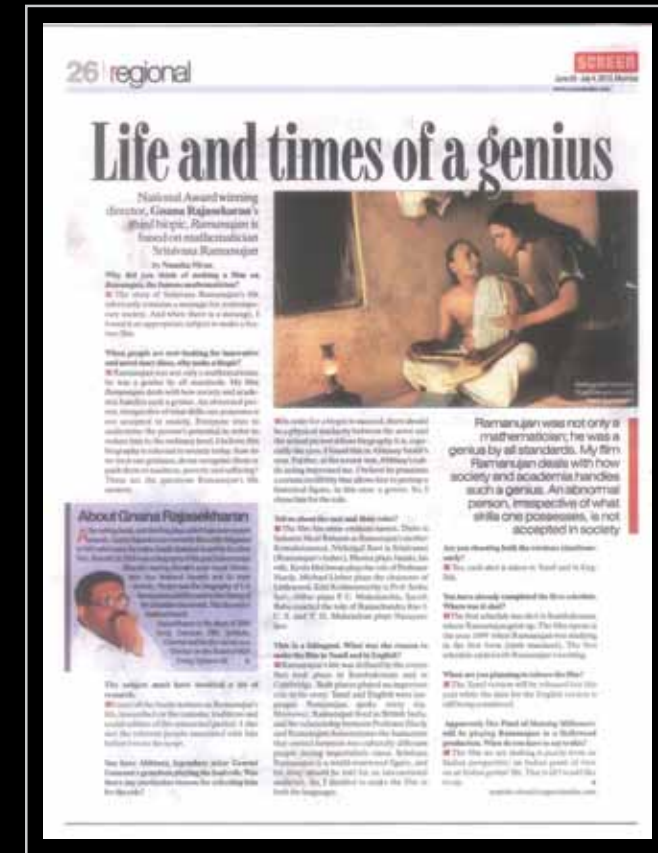
Screen Mumbai June 28- July 4