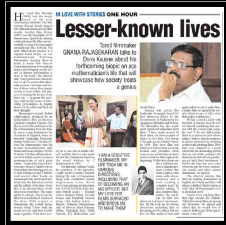
The Pioneer Delhi 10th August 2013