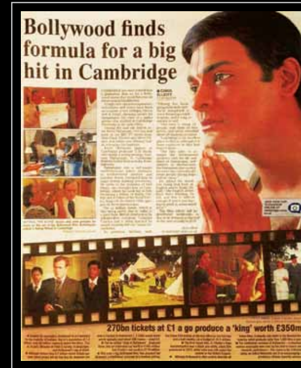
Cambridge News 10th August 2013