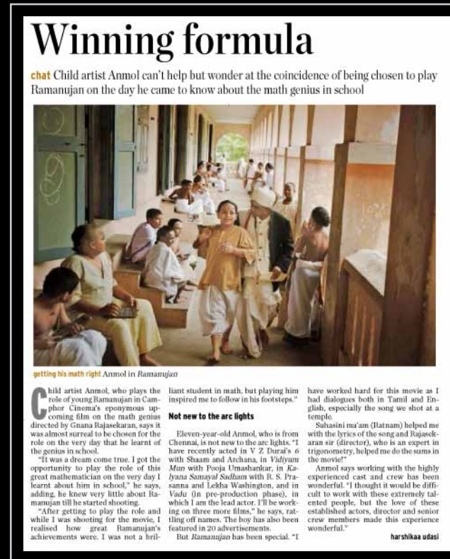
The Hindu (Cinemaplus) 18th August 2013