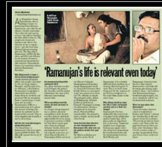
HT City Kolkata (Also in Ranchi) 10th July 2013